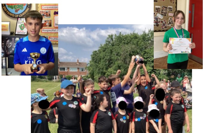
Congratulations Blue Team

Next week is National School Sports Week. We will be doing a variety of sporting events in school and next Friday, 20 th June, children are invited to come into school wearing their sports kits if they are part of a sporting team or dress up as their favourite sporting hero.