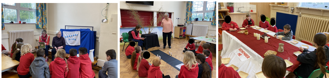
Taking part in the Open The Book Easter Experience.